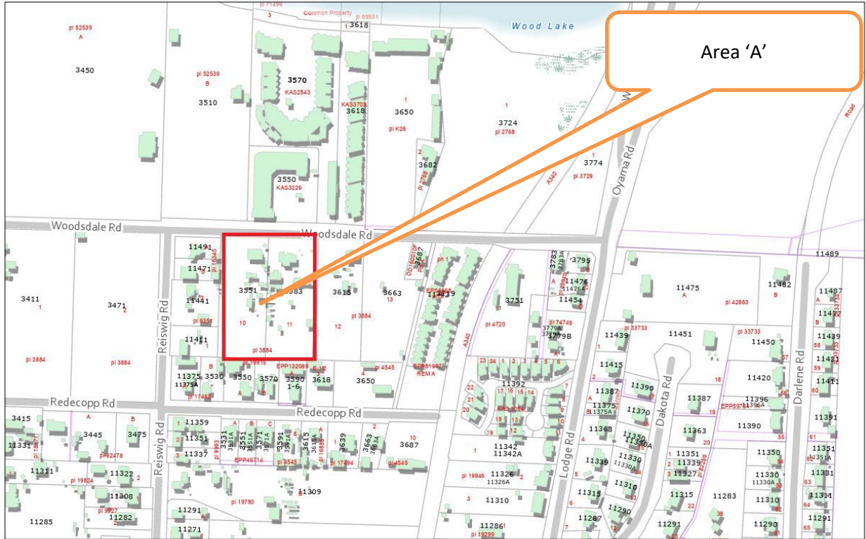
3551 and 3583 Woodsdale Location Map