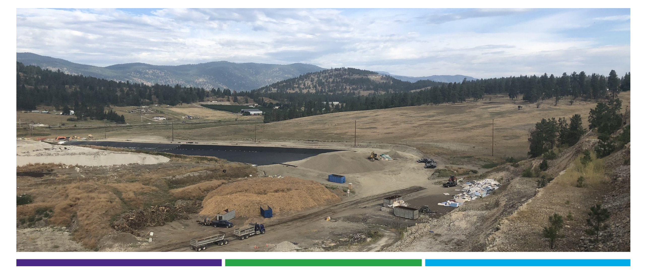
End of Presentation