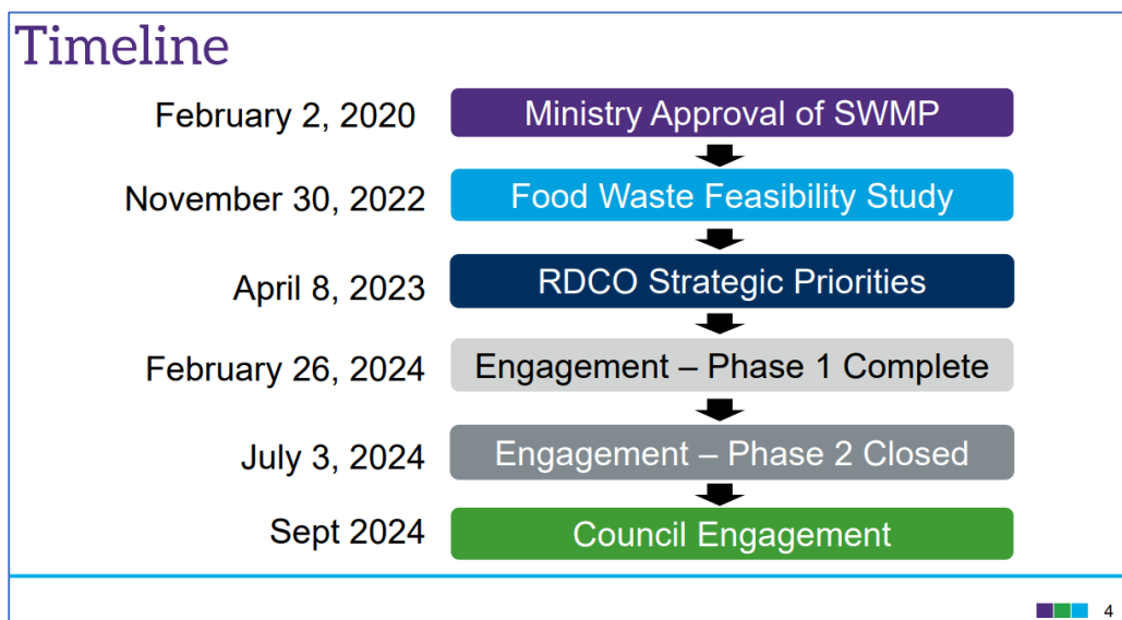
Figure 2. Curbside Food Waste Collection timeline presentation to Lake Country Council Sept 3, 2024